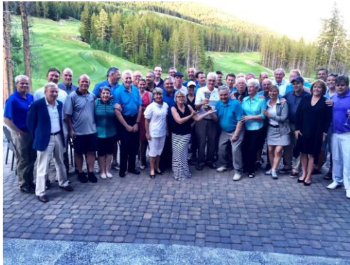
SKÅL Canadian Rockies raises the Memorial Cup in celebration!

The Team Scramble format, resulted in the Canadian Rockies team retaining the cup for the 2 nd consecutive year.